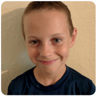
by Enoch Farnham, 12 Edmond, OK