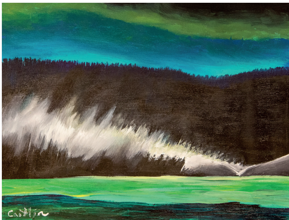
Perspective H 2 O, acrylics