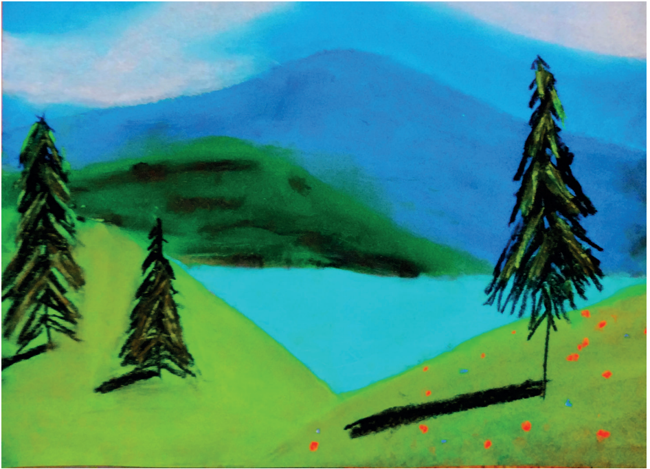
Mountains with Trees, oil pastels