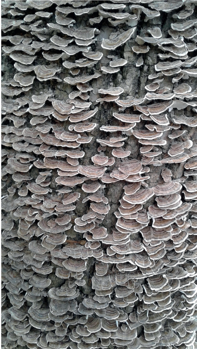
Mushrooms on a Tree, Samsung NOOK