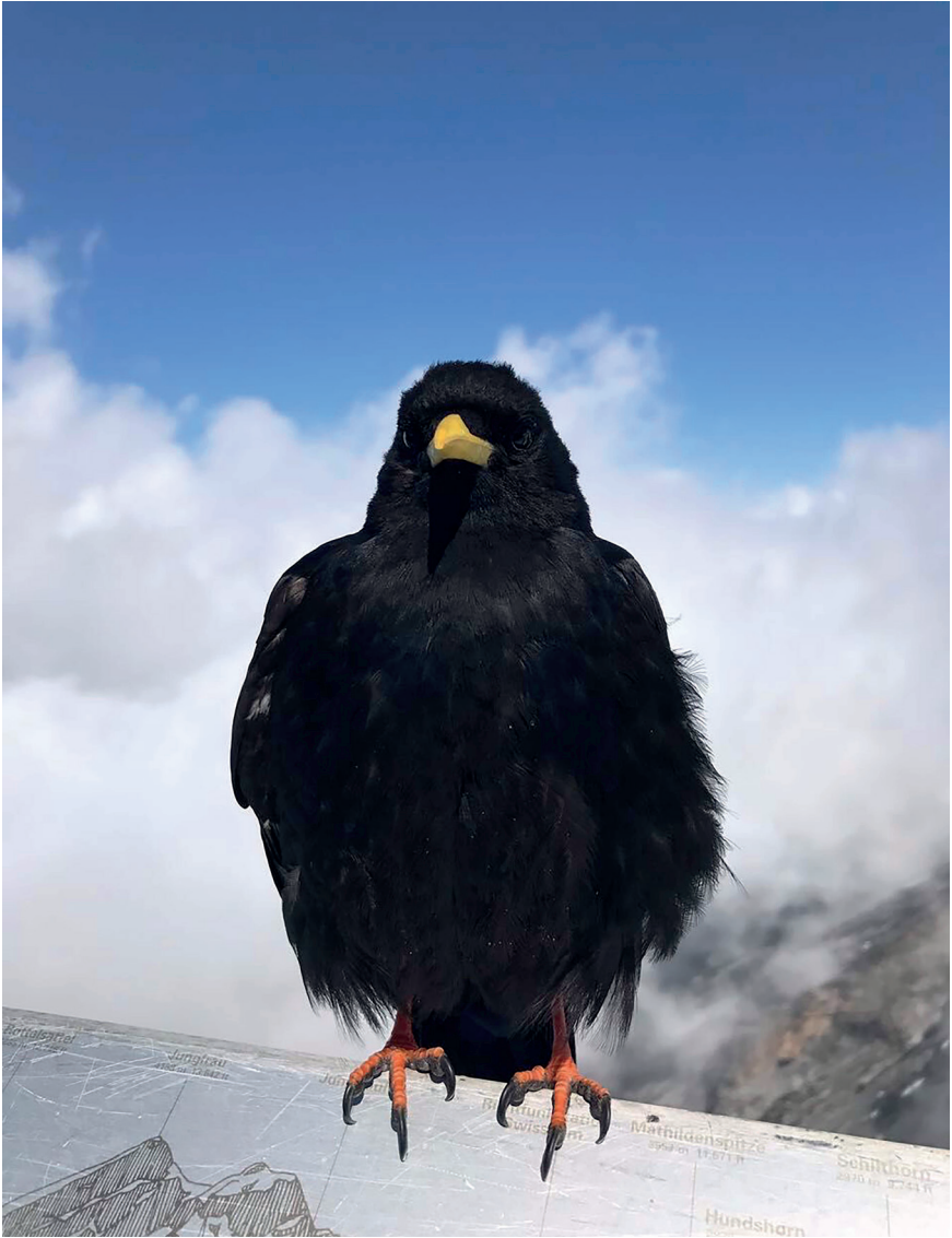
The Crow on Top of the Alps, iPhone 7 Plus