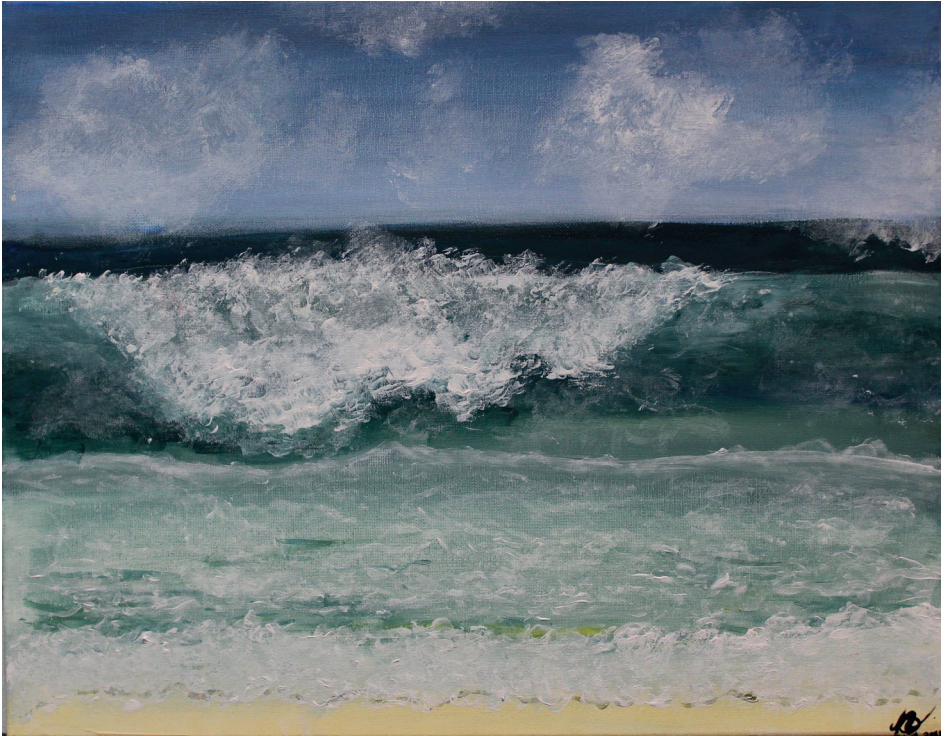
Admiring Ocean, acrylics